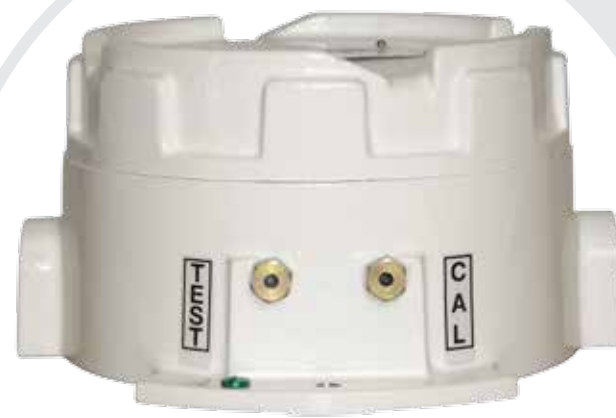
Remote Electronics Unit

In some instances, due to the tank design or process characteristics, a Pulse Point II unit will need to be lengthened in order to access the material. Extensions are used to extend the probe through a vessel wall or deeper into the material being measured. The Process Fitting is located in the normal location at the base of the housing. Extensions with a 90 degree bend are also an option to allow for a combination of horizontal mounting and the forks being in a vertical position. These are commonly used in hoppers or more of a funnel type vessel design where top mounting is not an option and vertical fork orientation is required.